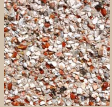
Durite available in 8-12mm or 3-8mm