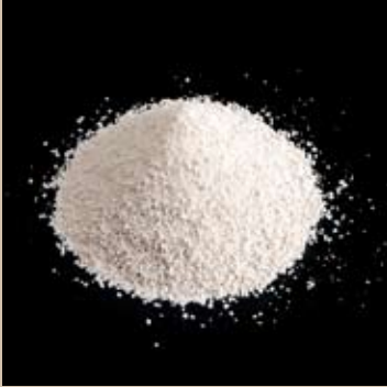
Limestone Sand Grade 1