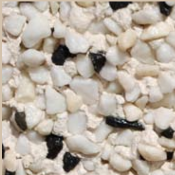
White Marble 90%, Black Limestone 10% available in 6mm or 10mm