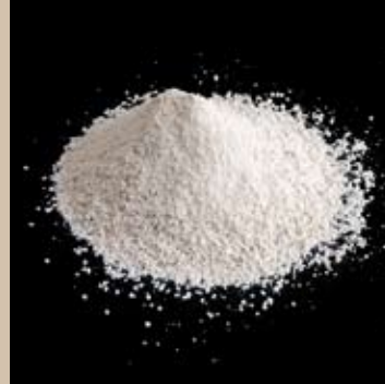
Limestone Sand Grade 3