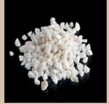
Dolomite Chips 8-11mm