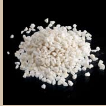
Dolomite Chips 4-8mm