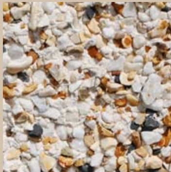
Garland Mix available in 6mm or 10mm