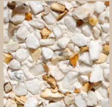
White Marble 50% Brown Shingle 50% available in 6mm or 10mm