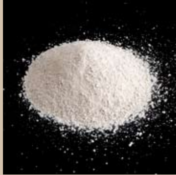
Limestone Sand Grade 2