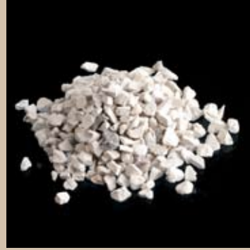
Limestone Chips 8-11mm