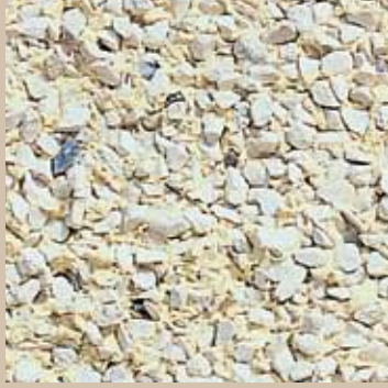
White Limestone available in 6mm or 10mm