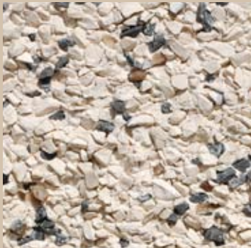
White Limestone 90% Black Limestone 10% available in 6mm or 10mm