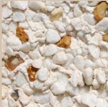
White Marble 90%, Brown Shingle 10% available in 6mm or 10mm