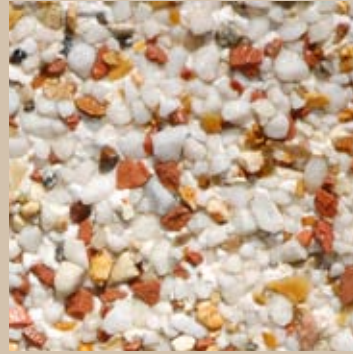
Ardmore Mix available in 6mm or 10mm