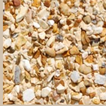
Brown Shingle available in 6mm - 11mm