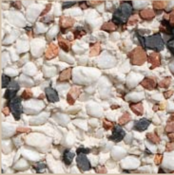
Glencairn Mix available in 6mm or 10mm