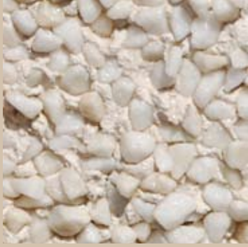
White Marble available in 4mm - 11mm