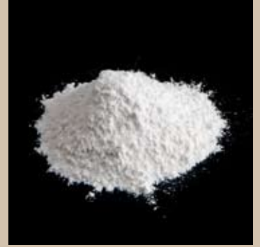
Calcite Industrial Filler