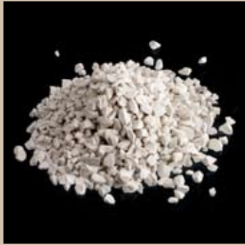
Limestone Chips 4-8mm