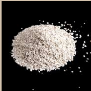
Limestone Grit available in 1mm, 2mm or 4mm