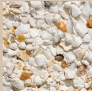
White Marble 75% Brown Shingle 25% available in 6mm or 10mm