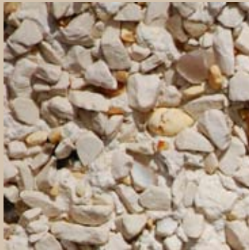
White Limestone 90%, Brown Shingle 10% available in 6mm or 10mm