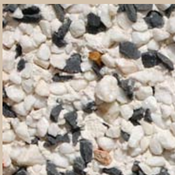
White Marble 80% Black Limestone 20% available in 6mm or 10mm