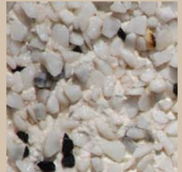
White Marble 95% Black Limestone 5% available in 6mm or 10mm