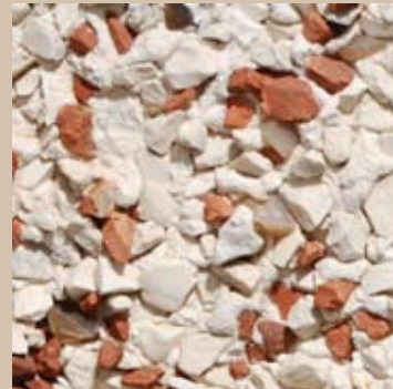
White Limestone 83% Cloburn Red 17% available in 6mm or 10mm