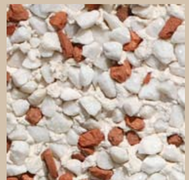
White Marble 80% Cloburn Red 20% available in 6mm or 10mm