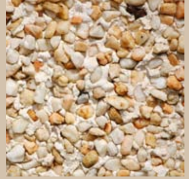
Barleycorn available in 6mm or 10mm