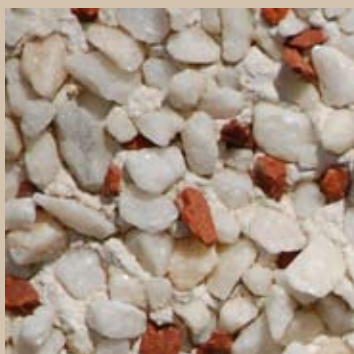
White Marble 90% Cloburn Red 10% available in 6mm or 10mm